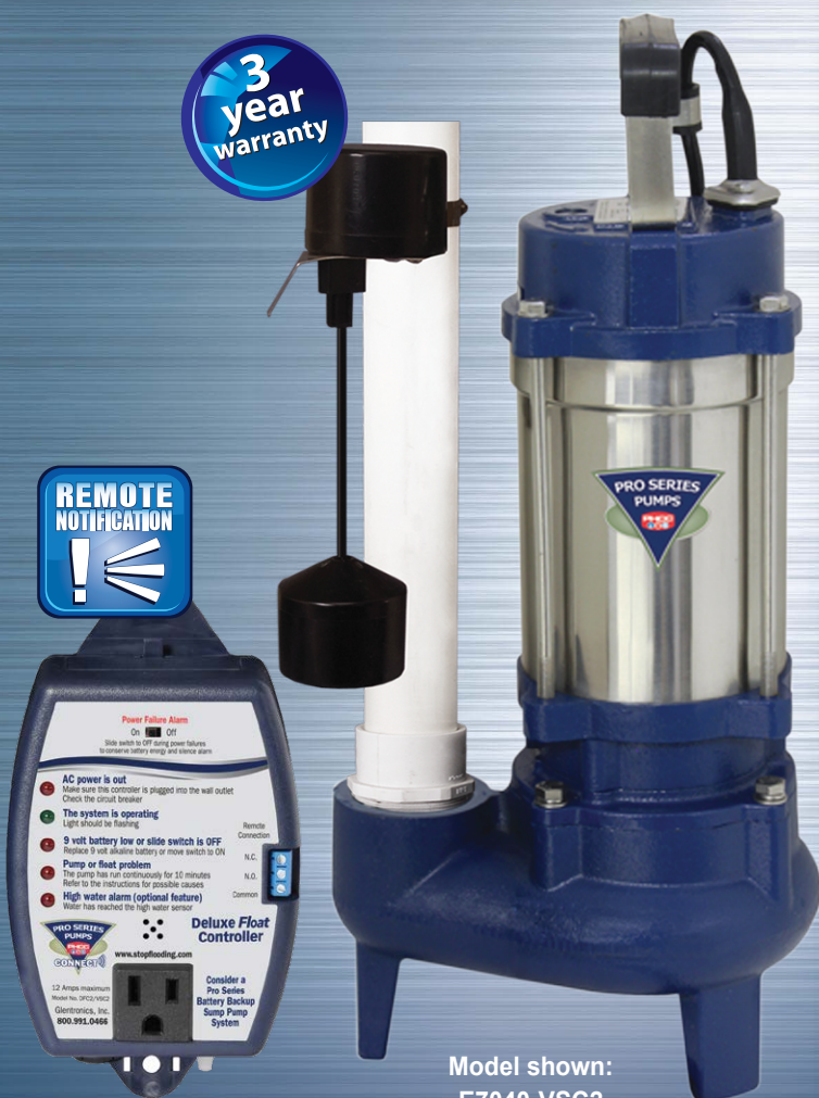
Model shown: E7040-VSC2